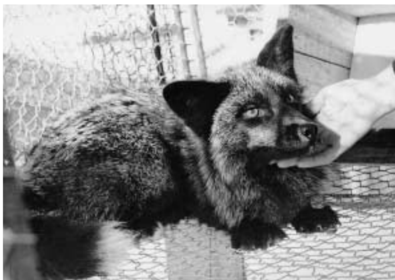
Figure 5. Foxes in Belyaev’s experimental group were selected to breed depending on how they reacted to their human keepers. Vicious foxes ( top left ) were excluded from the experimental population. Foxes showing slight fear and no viciousness toward humans were used in cross-breeding for the next generation ( top right ). Their offspring ( photograph, bottom ) were calm and showed no negative emotional responses to people.

Another, subtler possibility is that the novelties in our domesticated population are classic by-products of strong selection for a quantitative trait. In genetics, quantitative traits are characteristics that can vary over a range of possibilities; unlike Gregor Mendel’s peas, which were either smooth or wrinkly with no middle ground, quantitative traits such as an animal’s size, the amount of milk it produces or its overall friendliness toward human beings can be high, low or anywhere in between. What makes selecting for quantitative traits so perilous is that they (or at least the part of them that is genetic) tend to be controlled not by single genes but by complex systems of genes, known as polygenes . Because polygenes are so intricate, anything that tampers with them runs the risk of upsetting other parts of an organism’s genetic machinery. In the case of our foxes, a breeding program that alters a poly-